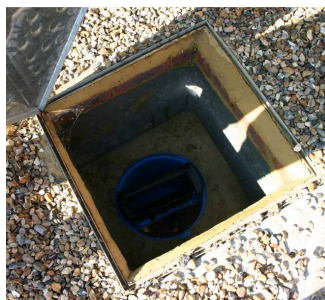
Underground water storage tank to harvest rainwater at Baldwin's Oast, West Malling

A pump needs to be installed to move the water to the point of use and a filter needs to be fitted to remove debris.